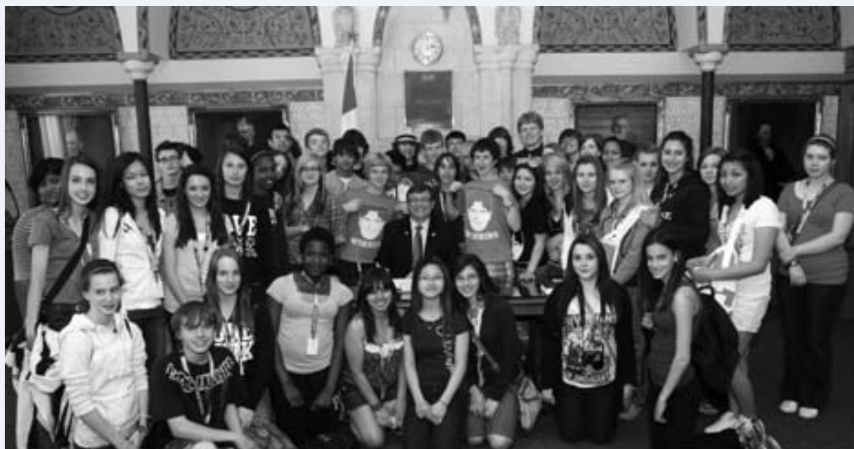
St. Gabriel School Students attend Swearing In Ceremony